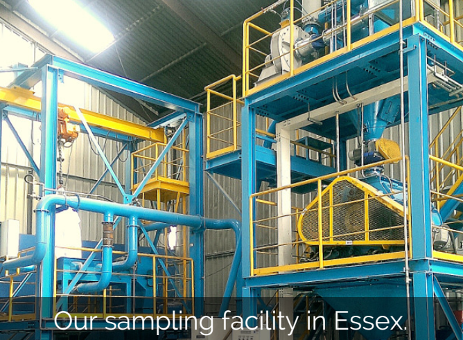
Our sampling facility in Essex.