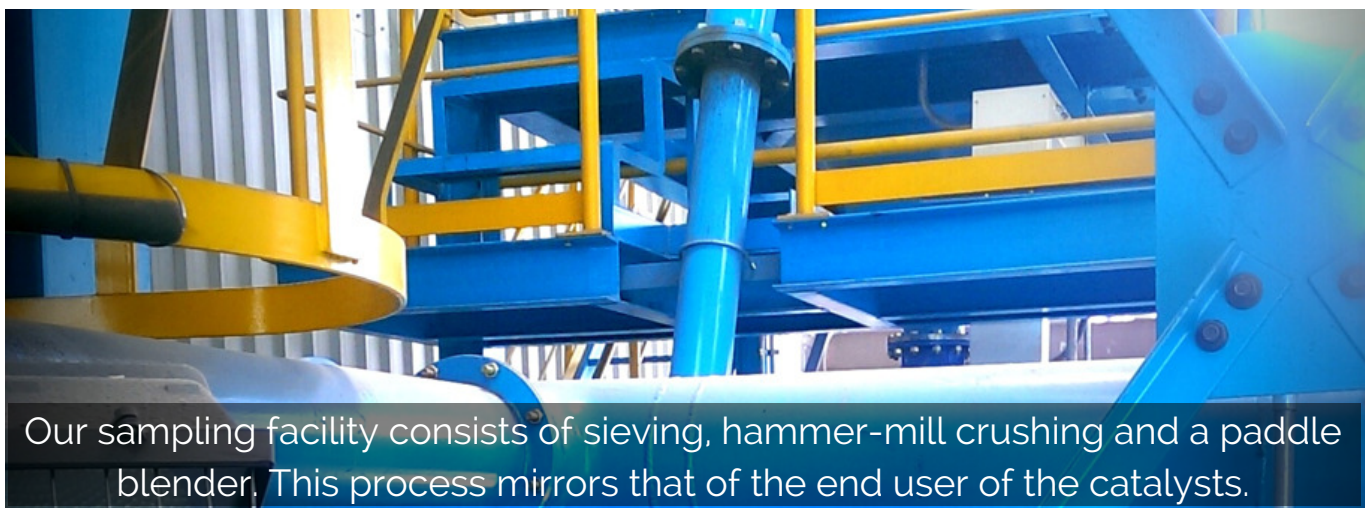
Our sampling facility consists of sieving, hammer-mill crushing and a paddle blender. This process mirrors that of the end user of the catalysts.