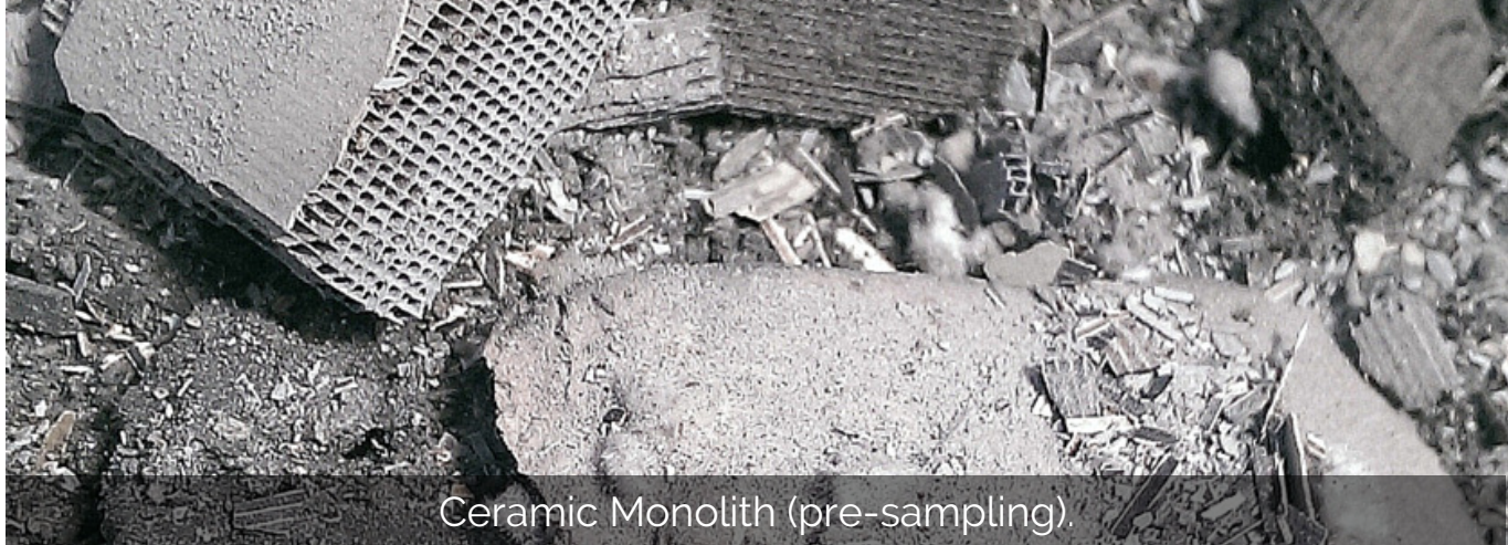
Ceramic Monolith (pre-sampling).