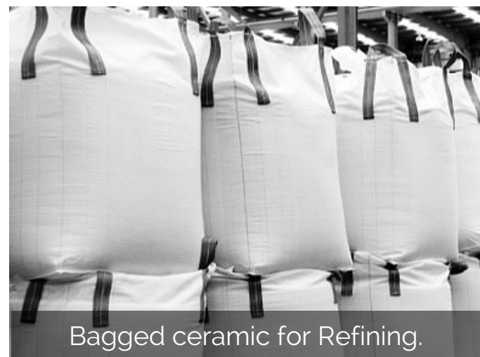
Bagged ceramic for Refining.

F.J. Church & Sons Ltd offer a service for ceramic and metallic catalysts, along with oxygen (lambda) sensors - which contain precious metals that can be extracted through shredding.